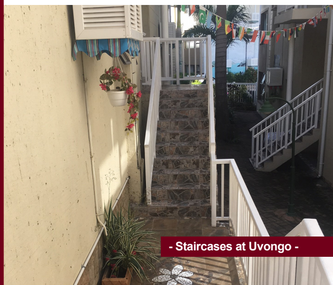
- Staircases at Uvongo -

Locking up your unit and wandering through the corridors to arrive at the staircase, you may notice some other changes. Certain staircases have been tiled to fit into the “Little Italy” theme and complete the spaces nicely, “assolutamente bello!” (Absolutely beautiful!) Along with the staircases and as an important part of our ‘vibe’ at the Resort, our murals are once again being attended to. Our mural artist, Hennie , is incredibly talented and has transformed the once plain Resort into a vibrant space and representation of what a typical Italian seaside town or village looks like.