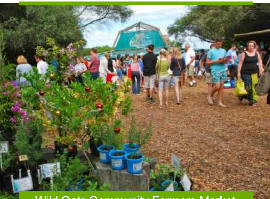
- Wild Oats Community Farmers Market -