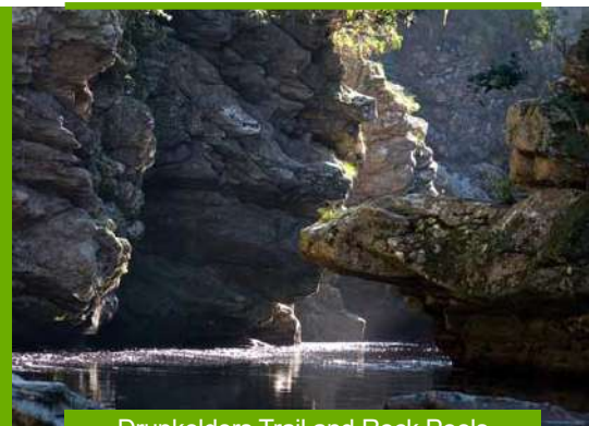
- Drupkelders Trail and Rock Pools -

Pop us a mail at yourresortstory@oaks.co.za