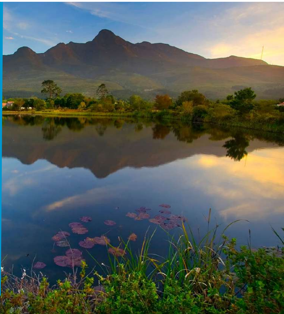
- Garden Route Botanical Gardens -

The gardens offer full day hiking trails , scenic hiking trails around the dam and shorter trails along the streams . The mushroom meander offers something a little bit different from most botanical gardens and promises a unique and spectacular experience. There is also a herbarium, tea garden, a dam and bird hide, a nursery and much more. With plenty to do for the whole family, be sure to make a day of it!