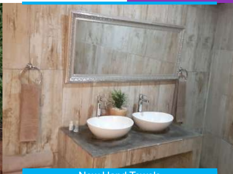
- New Hand Towels -