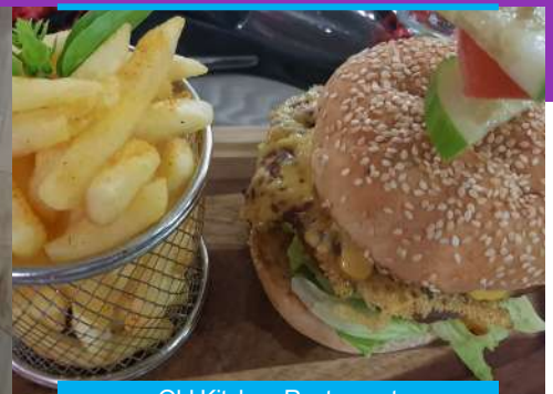
- Old Kitchen Restaurant -