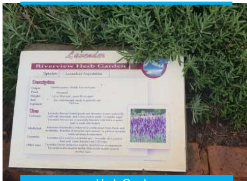
- Herb Garden -

Expand your portfolio a week or few today; because in the end spending time with your family is worth every second. Please contact levies@mountamanzi.co.za for more information.