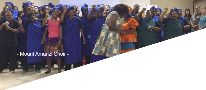
- Mount Amanzi Choir -