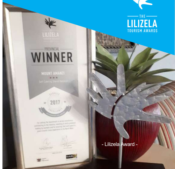
- Lilizela Award -