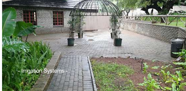
- Irrigation Systems -