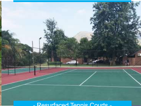
- Resurfaced Tennis Courts -