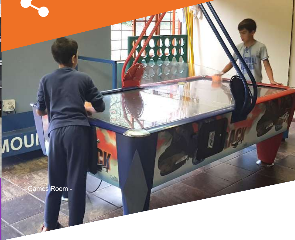
Games Room -