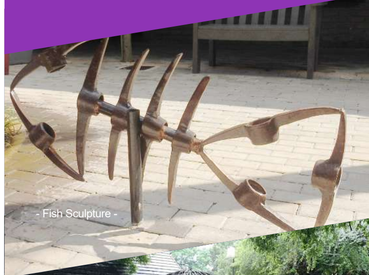
- Fish Sculpture -

Potato and Leek Soup, Served with Ciabatta