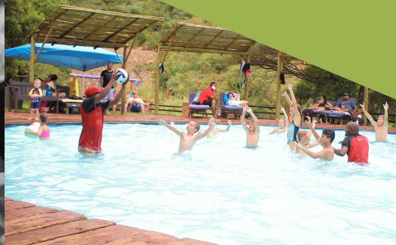
- Entertainment team -

The Eco Cubs and Eco Teens activities remain a firm favourite. The younger guests have the super opportunity to learn all about nature and the Mabalingwe environment and ecosystem. Our rangers are constantly teaching new and useful information, which highlights the importance of the conservation efforts of the Resort and more.