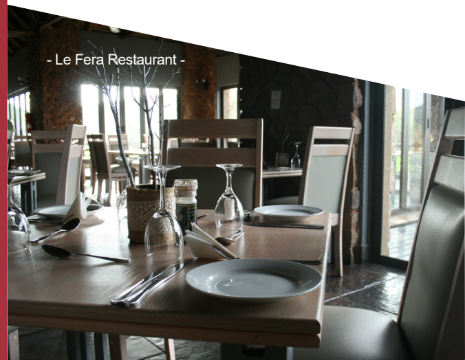
- Le Fera Restaurant -