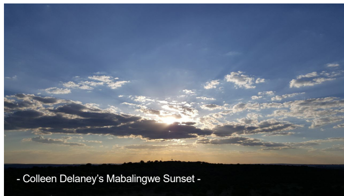
- Colleen Delaney's Mabalingwe Sunset -