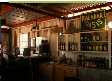
- Kalahari Oasis Pub -