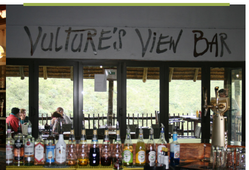
- Vulture's View Bar -