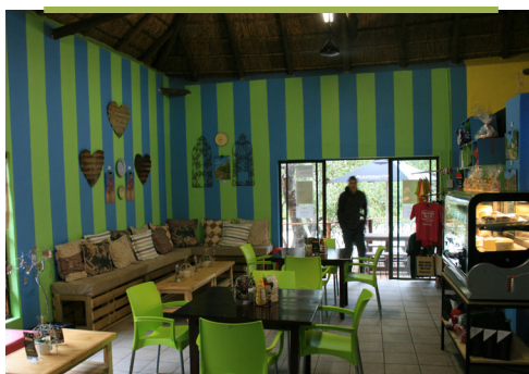
- Boeretroos Coffee Shop -

From one pub to another; the Vulture’s View Bar has been opened on the viewing deck. This little gem, tucked away and elevated over the landscape, like the nest of these fascinating creatures it has been named after, has a majestic view over the Nature Reserve and offers guests the perfect spot to sit, relax and enjoy refreshments as the sun sets on the horizon. Nibble on a light lunch with an ice cold drink in your hand, overlooking the Mabalingwe landscape or round up family and friends for any one of our weekly specials and refreshing cocktails. Try our signature cocktail: The Vulture!