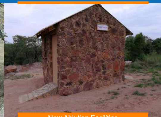
- New Ablution Facilities -