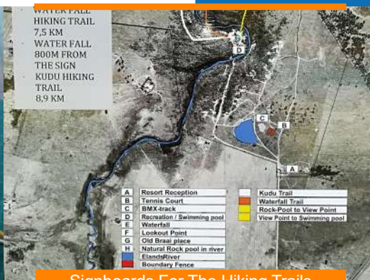
- Signboards For The Hiking Trails -