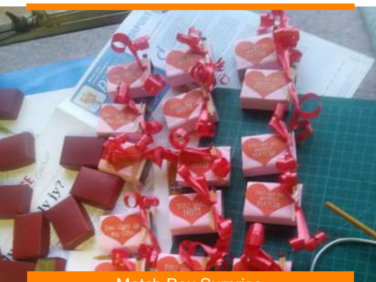
- Match Box Surprise -

These changes are made so that shareholders may reap the full rewards of their ownership. Some of the changes are in response to suggestions from our shareholders, and some of them are initiated by staff because of the care and love they have for Little Eden.