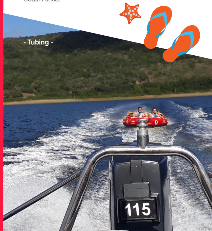
- Tubing -

Knysna offers nature trails, warm beaches, world class golf courses, and some of the best shopping spots in the area. Other places of interest in Knysna include the Knysna Yacht Club, Millwood House Museum, Millwood Gold Mines, and the Knysna Forest which is the largest indigenous forest in South Africa.