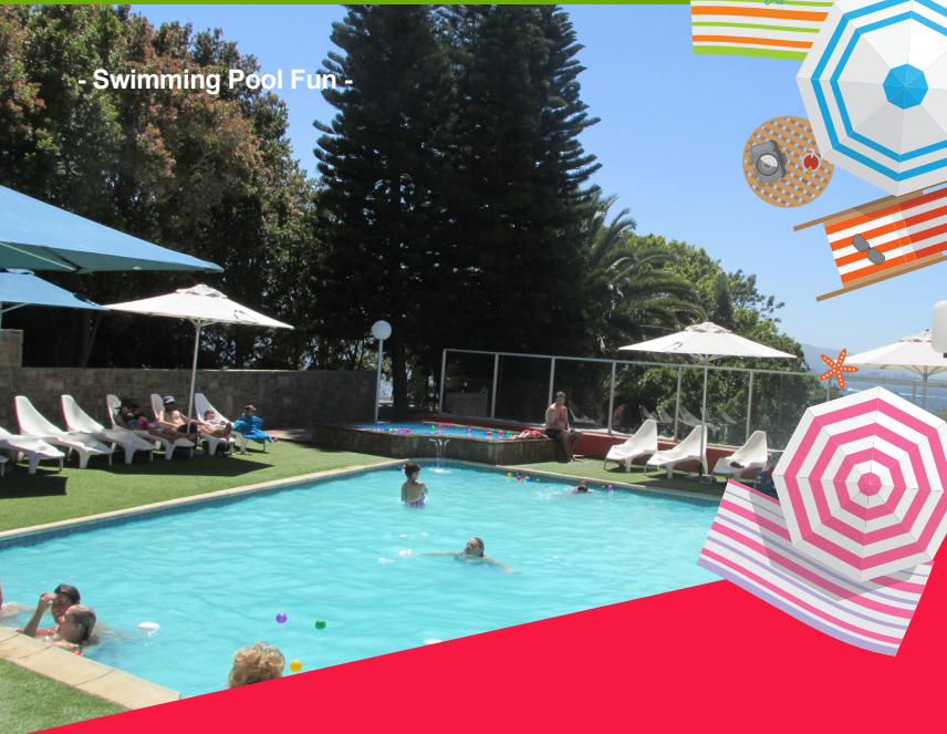
- Swimming Pool Fun -