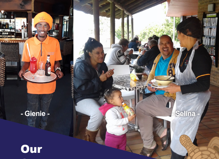
- Gienie -