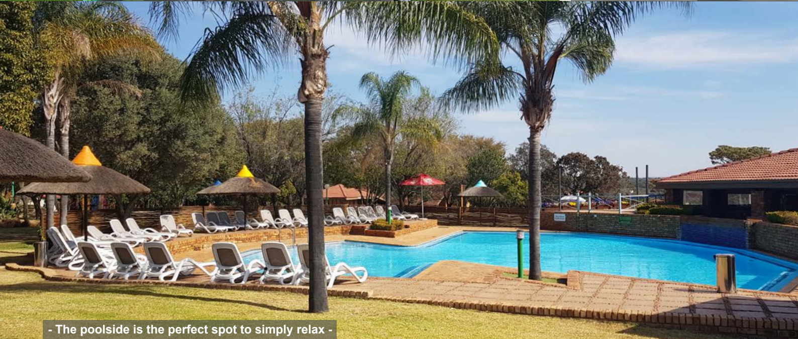
- The poolside is the perfect spot to simply relax -