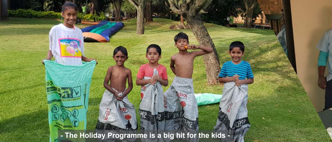
- The Holiday Programme is a big hit for the kids -