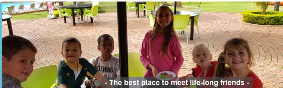
- The best place to meet life-long friends -