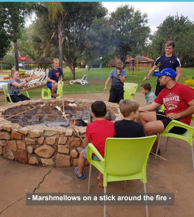
- Marshmallows on a stick around the fire -

The December holidays are all about fun activities under the South African skies. The holiday programme introduces new games to kids that stimulate the mind and get them away from their electronics for a few hours. Sack Races, Giant Jenga, painting and Morabaraba are just a few games that have proven to be extractors of laughter and fun; these games will be a part of the planned programme for December.