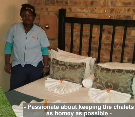
- Passionate about keeping the chalets as homey as possible -