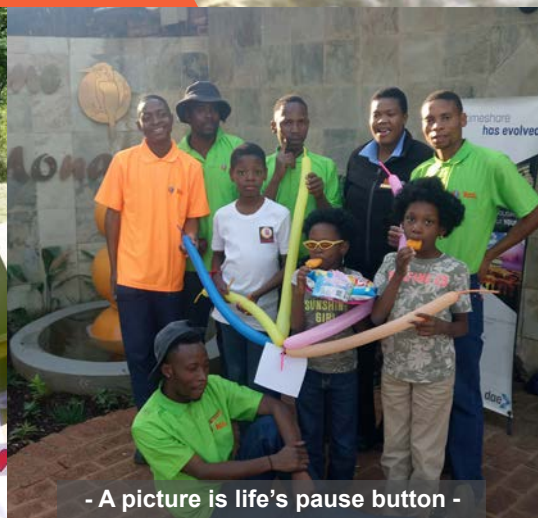
- A picture is life's pause button -