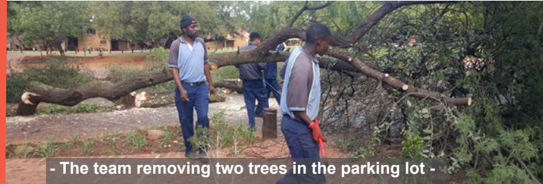
- The team removing two trees in the parking lot -

We have learnt over the years that in order to keep Manzi Monaté as wonderful as possible for you, maintenance is key. Here are some of the new improvements we have made to your home-away-from-home this year: