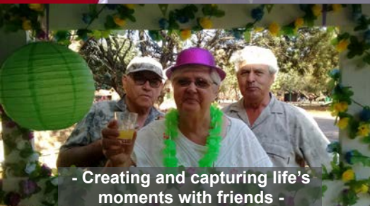
- Creating and capturing life's moments with friends -