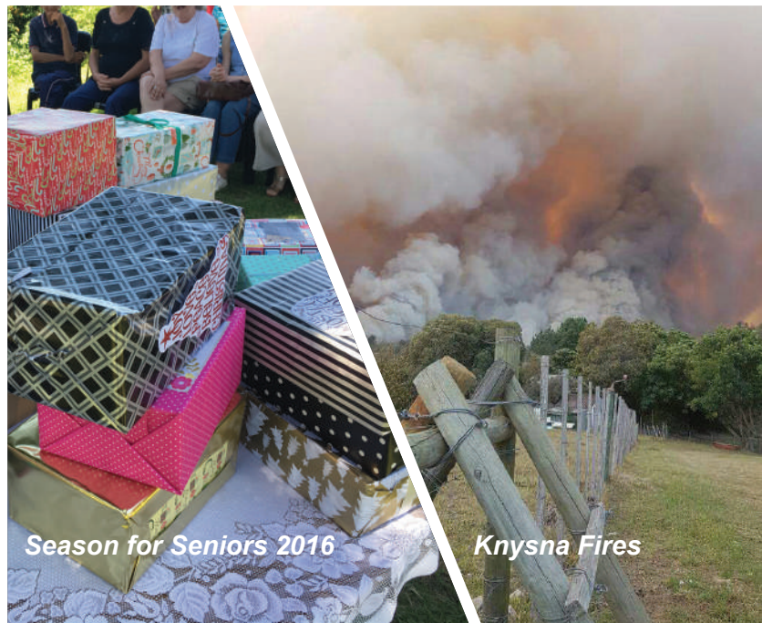
Season for Seniors 2016

African Blessings , a Non-Profit and Public Benefit Company ran a three-month campaign, called Season for Seniors, during the last few months of the year. There are elderly people in the communities that African Blessings serves, who are truly in need of basic items – items, which we see as everyday essentials (toothpaste, soap, toothbrush etc.) and often take for granted. But for these needy folk, they are true blessings and would significantly impact their quality of life this Festive Season. The majority of these elderly people are bitterly poor, forgotten and ignored; and many have not been fortunate enough to ever receive a gift. And for this reason, we decided to donate towards Season for Seniors. To read more about this campaign and African Blessings visit: www.africanblessings.co.za