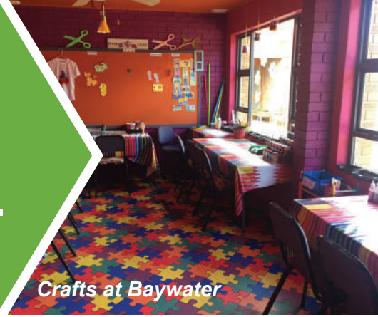
Crafts at Baywater