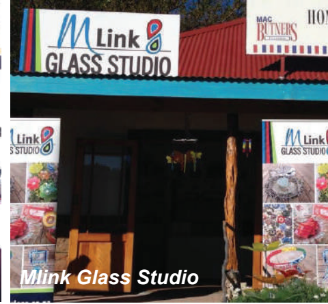
Mlink Glass Studio